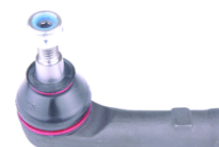
Tie Rod End Front Left M16x1,5RHT 1097323