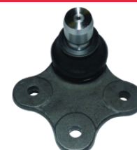
Ball Joint Front D=Ø18mm 93BB3395AC