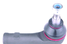
Tie Rod End Front Right M16x1,5RHT 1097316