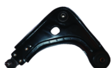
Suspension Control Arm and Ball Joint Assembly Front Left Lower 6L8Z3079AA